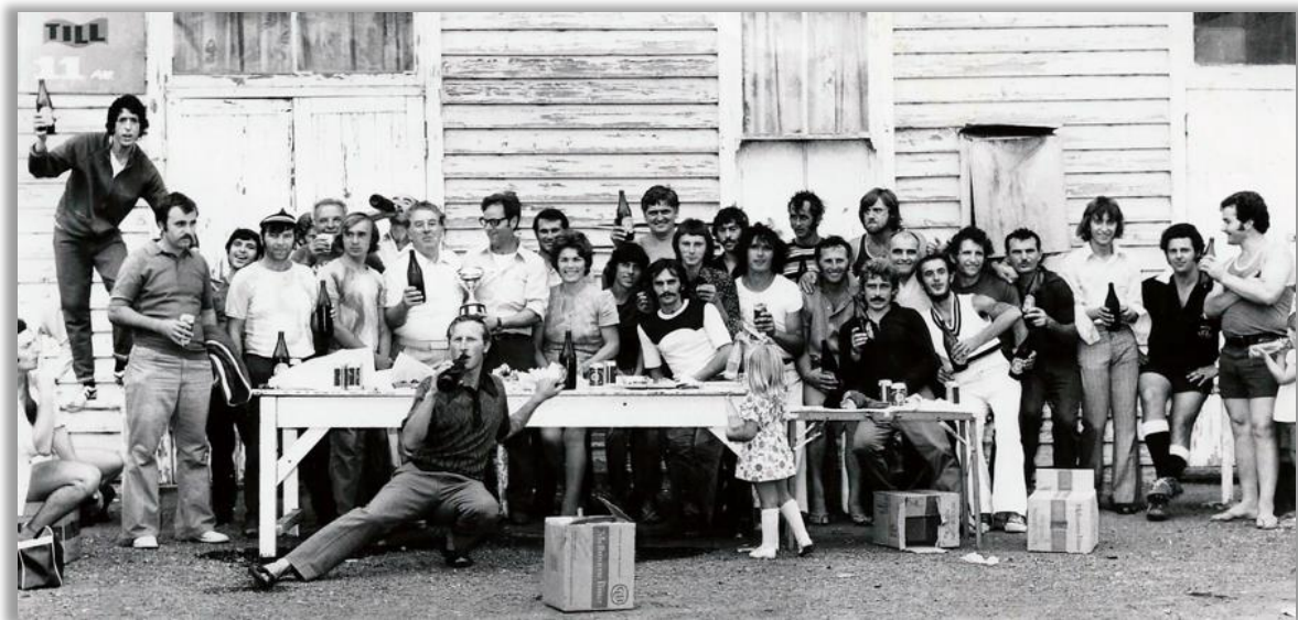
Another championship celebration

We (the family) think it would be fitting if he was duly recognized by the Croatian Soccer Association of Australia for his contribution and efforts.